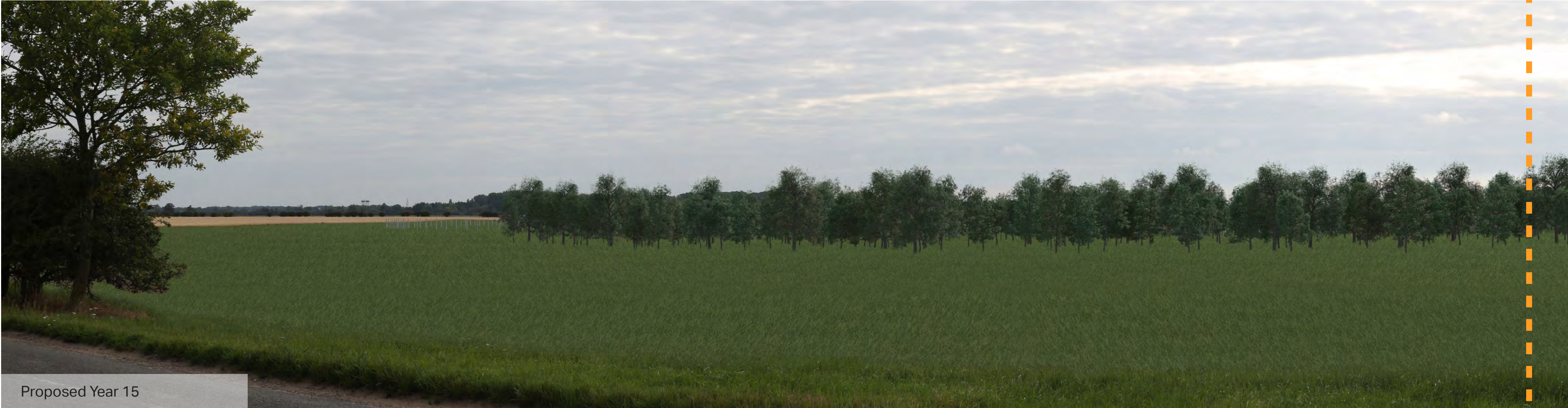
Proposed Year 15