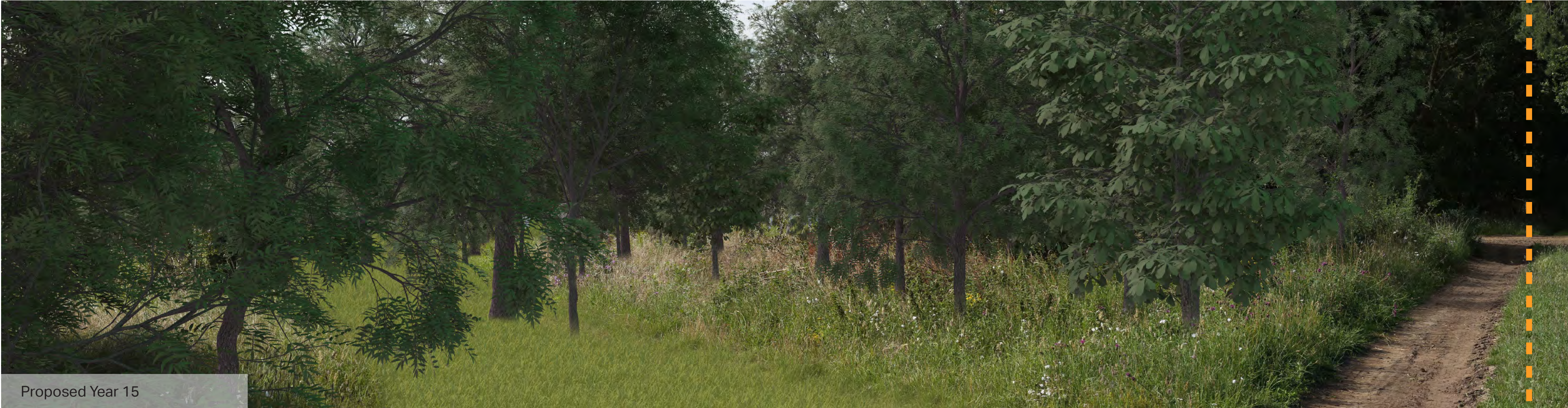
Proposed Year 15