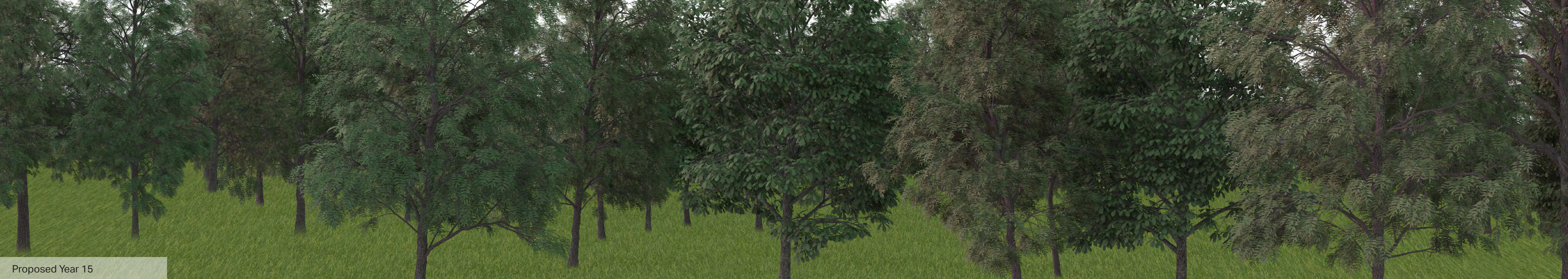
Proposed Year 15